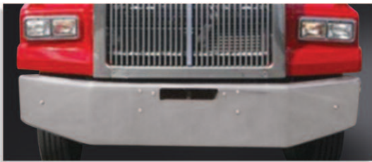
4900 SA years 2007 & older, 14" set back ABP N31 7II201044 with fog lights ABP N31 7II001044 no fog lights (shown)