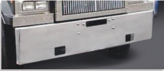
4900 SF & EX years 2007 & older, 18" texas square ABP N31 OIC201006 with fog lights (shown) ABP N31 OIC001006 no fog lights