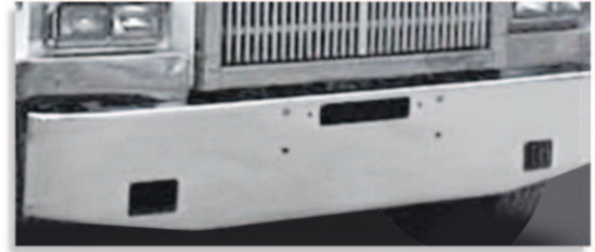
4900 SF & EX years 2007 & older, 16" tapered ABP N31 OIC201002 with fog lights (shown) ABP N31 OIC001002 no fog lights