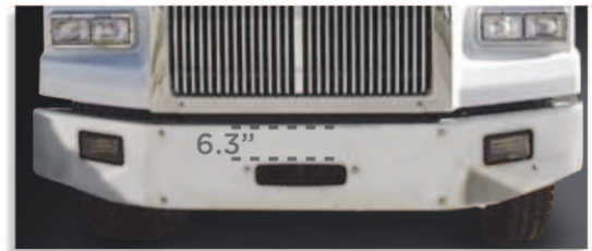
4900 SA years 2008 & newer, 14" set back ABP N31 7IJ201044 with fog lights (shown) ABP N31 7IJ001044 no fog lights Check tow pin hole position before ordering