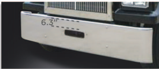
4900 SF & EX years 2008 & newer, 18" texas square ABP N31 7IH201006 with fog lights ABP N31 7IH001006 no fog lights (shown)