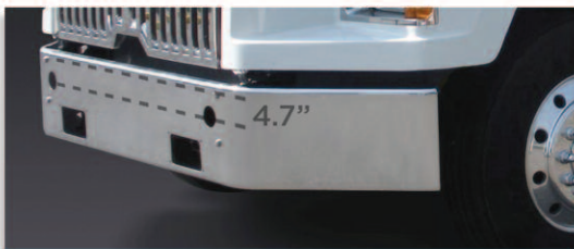
4700SB ABP N31 D052715 with fog lights (shown) ABP N31 D031915 no fog lights Check tow hole position before ordering